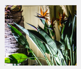
Spotlights: Great for illuminating individual

plants or trees and turning them into a garden feature.